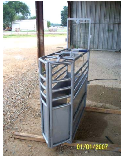
Smaller version of our calf roping chute ... this one is designed just for calf ropers.