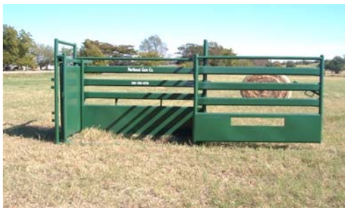
Rough Stock Bucking Chutes