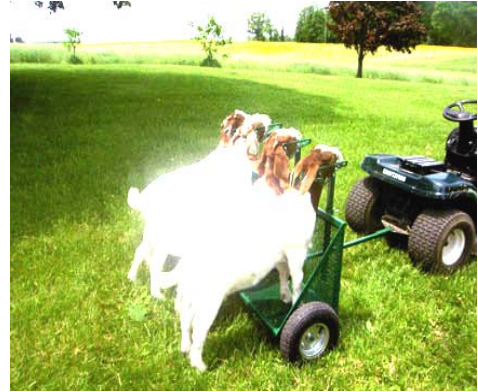
Chariots come with adjustable head pieces and reversible hitch; 2, 3 or 4 head piece systems sold.