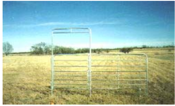
Panel gate shown with skid style feet. Bow-gates come in various widths, heights with 3 different types of latch systems.