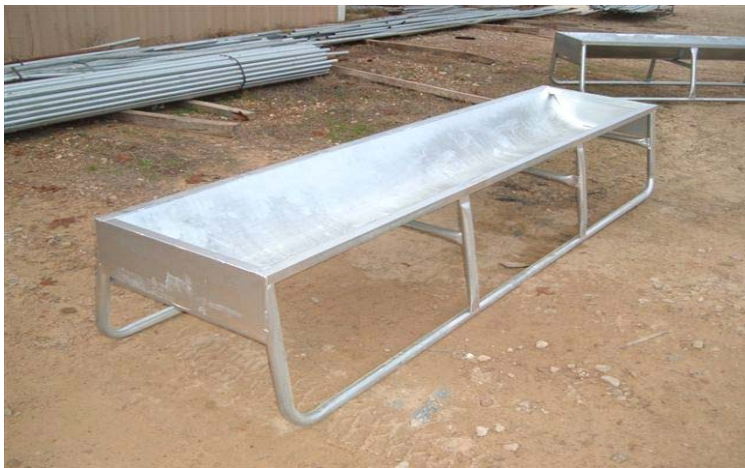
Bunk Feeders are great for horses or cattle.