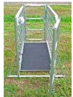
Digital Scale and Scale Cage.