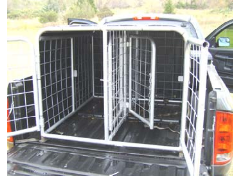
Custom Tote for Pigs with four compartments.