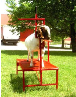
A stanchion for trimming face area or milking out stock.