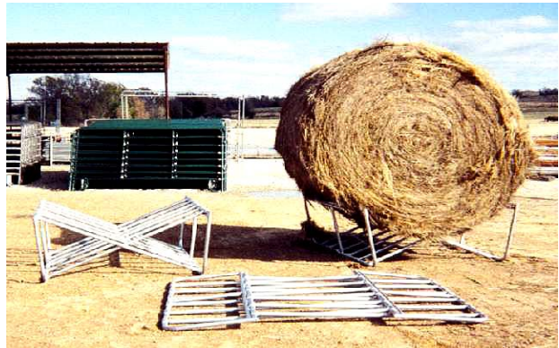
Round bale feeder sets up easy and folds down easily for storage.