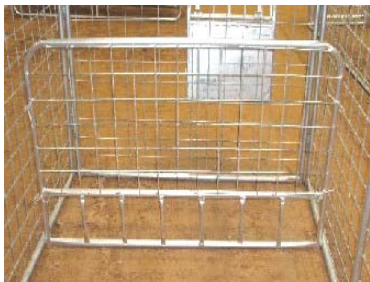
Kid-safe panel allowing that safe space.