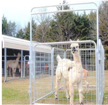
4x4 wire pen can be used for alpacas, llamas or miniature horses even.