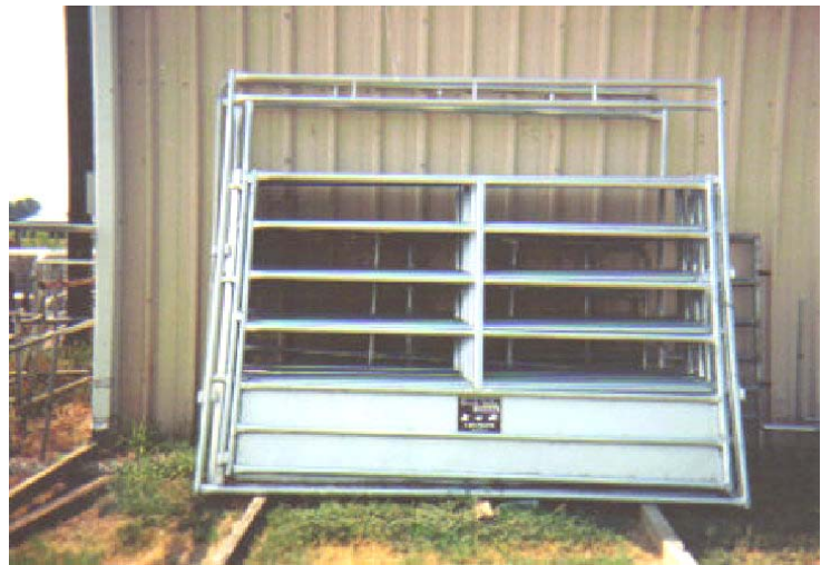
Round Pen gates and panels. Many sizes and options available on all panels.