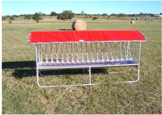
Heavy duty hayrack with trough and rain canopy.