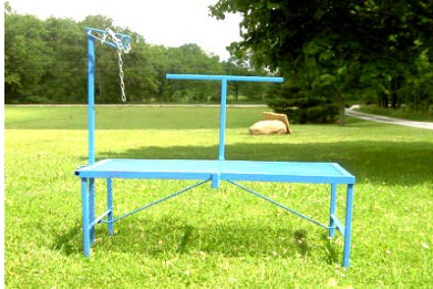
They come in many colors with T sidebar.