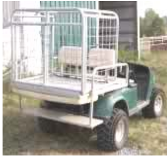
Custom for Golf Cart.