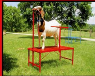
Chariots & Fitting Stands