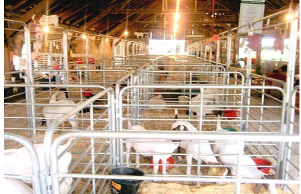
Horizontal nine bar panels and gates come in a variety of sizes.