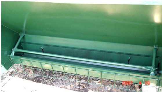
Creep Feeder trough bar.