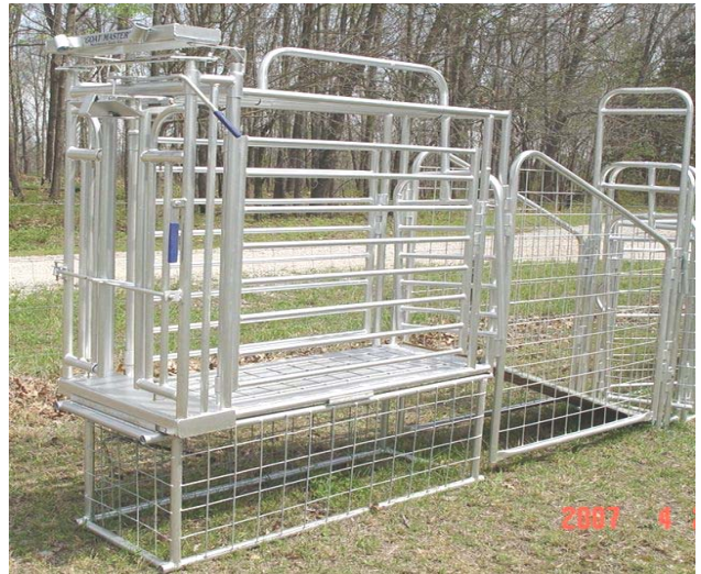
Goat Master Working Chute.