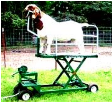
Goat Butler, a unique scissor stand, dollies and raises stock to working levels.