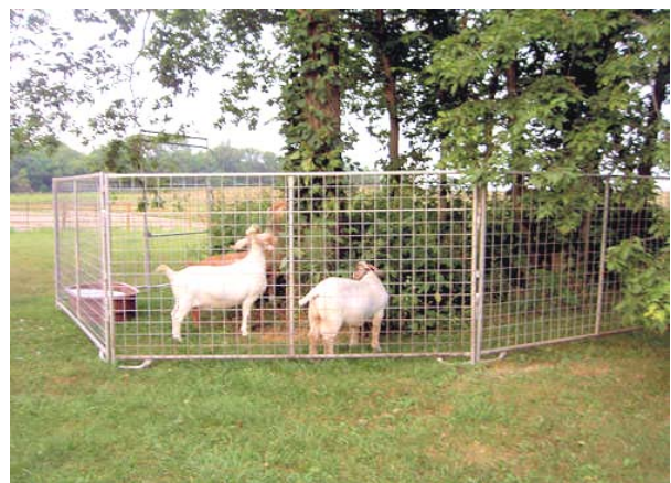
These panels have skid style feet and are filled with 4x4" wire paneling. Pictured at 6' height by 10' length, 7' or 8' at the bowgate.