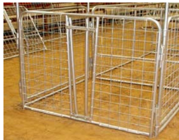
Grafting panel for latching the kids on.