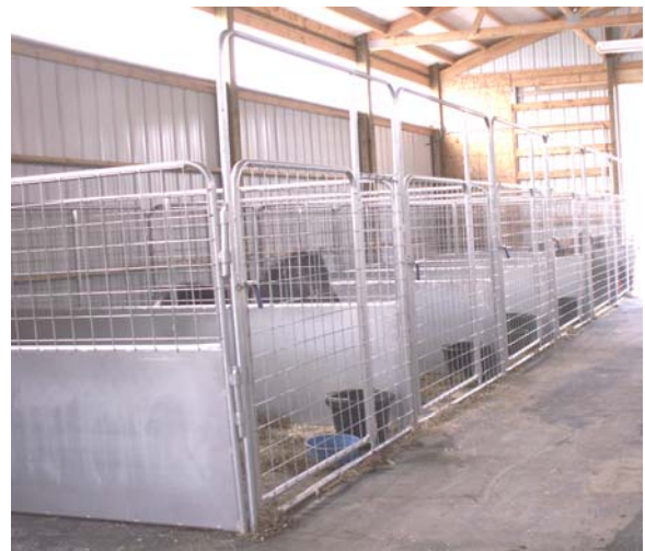
Pictures showing custom options for horse stalls and or livestock pens.