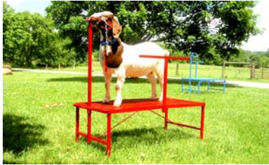
Fitting Stands come with two head pieces.