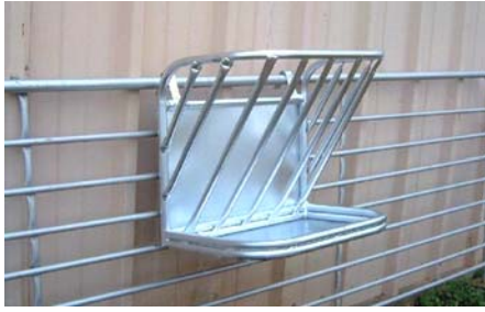
Show pen feeder