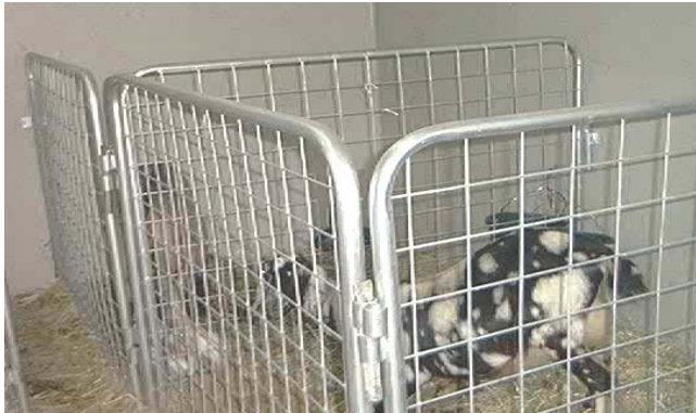
4x4 wire heavy duty panels and gates and a 4x4 wire pen using wallpockets.