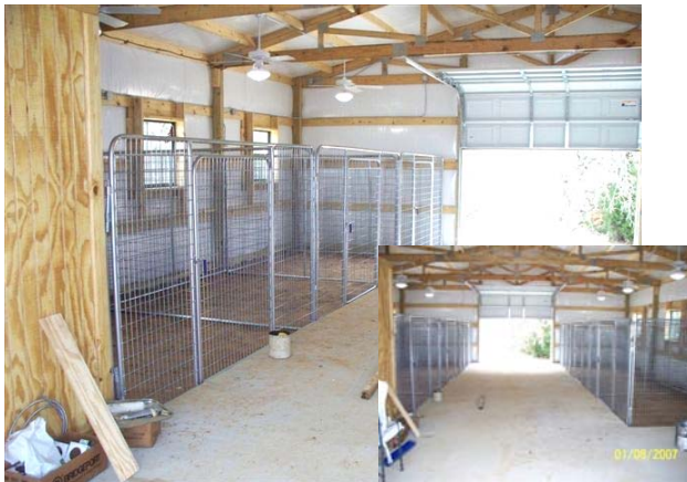
Miniature Horse Stalls but can be used for other livestock as well as kennel applications.