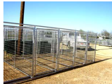
Kennels pin quickly without tools. Kennels can be used for poultry and other livestock as well.