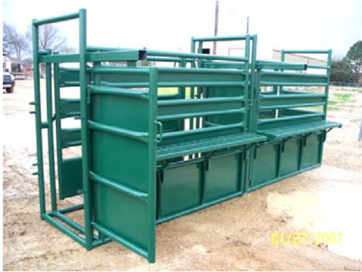
Photos of our quality bucking chute systems. Options available on these as well.