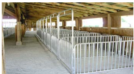
Vertical bar panels and gates prevent climbing on panels, a great option for swine producers or goats and sheep.