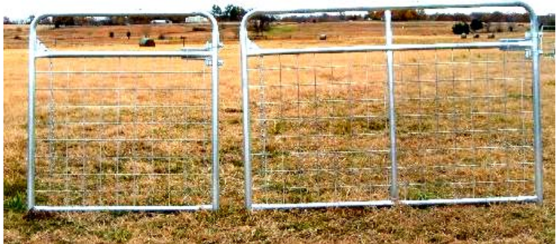
4x4" wire filled Sheep and Goat pasture gates come in a variety of lengths as well as custom.