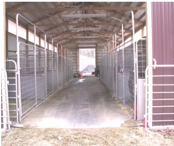
Pictures showing custom options for horse stalls and or livestock pens