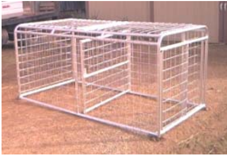
8' Goat Tote with divider panel.