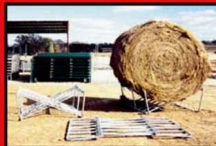
Grain & Hay Feeders