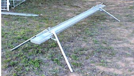
Econo-trough with bar