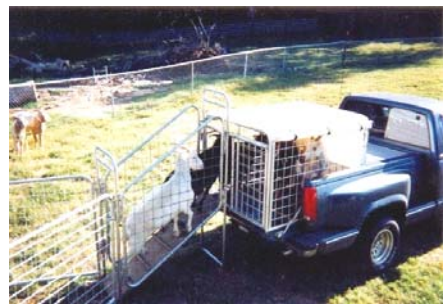
Loading chute in use.