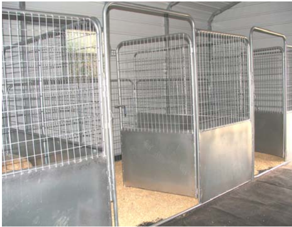
Pictures showing custom options for horse stalls and or livestock pens.