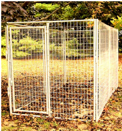
Kennels also come in a variety of sizes. These frames are filled with 2x4" wire panel.