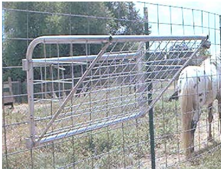
Wall Mount Hay Rack for mounting on walls or hanging over panels or fences.