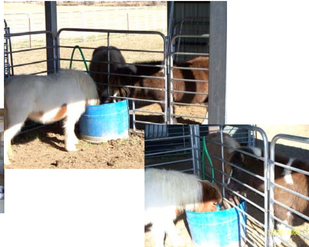
New Water Gate Panel - allows for two areas to share the same trough. This panel can be built to allow for feed systems also.