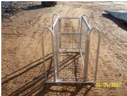
New style of scale cage pictured in top and bottom photo.