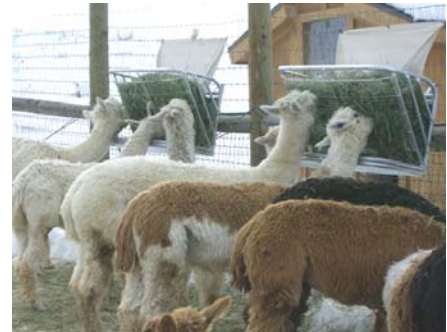
Show pen feeders can be built in larger sizes to accommodate groups of livestock.