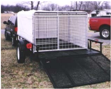
Goat Totes can be built in custom sizes. Tote Cover custom colors shown right.