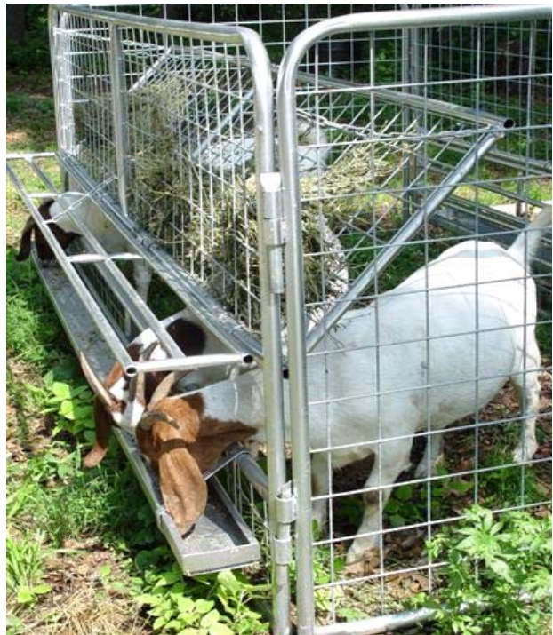
EZ Feeder panel with hayrack.