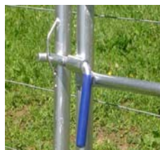
Latch options for gates: vertical, chain and horizontal latches.