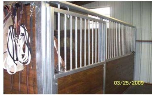
Stalls designed with grills and frames designed for lumber, plywood or sheet metal. Other style options.