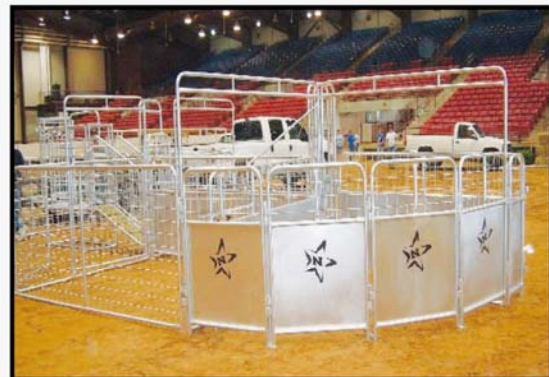
Working Chute Systems