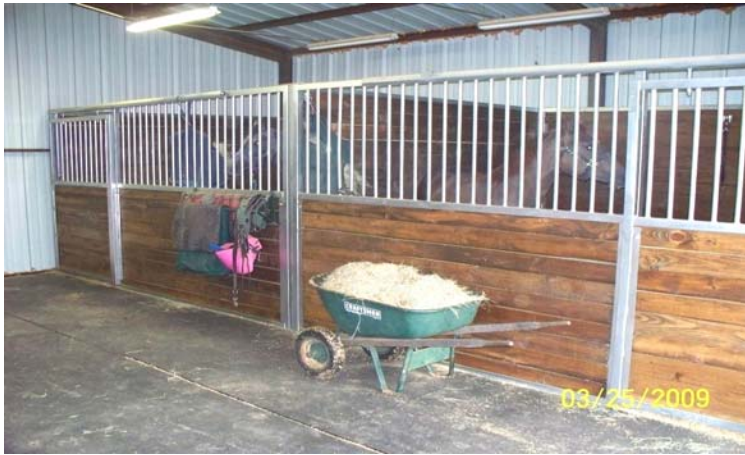
Horse stalls come with swinging doors or sliding roller doors. Add-ons include swing out feed door, bucket door, and feeder.