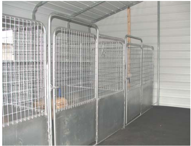
Pictures showing custom options for horse stalls and or livestock pens.