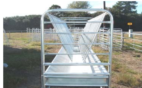
8' Heavy Duty Hay Rack with vertical bars.