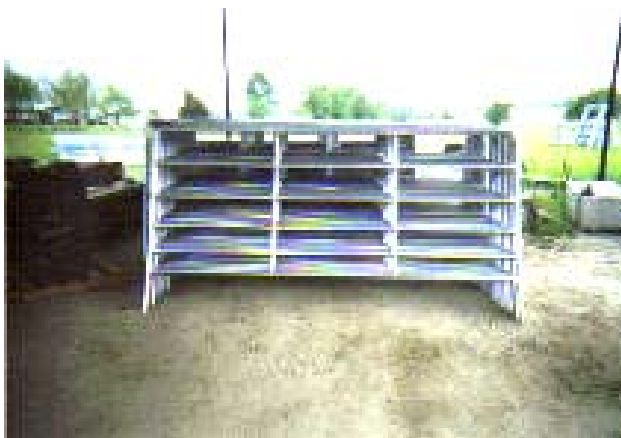
Another panel style with legs versus the skid style feet. Shown are the horizontal bar style panels. Panels available in lighter or heavier gauge.