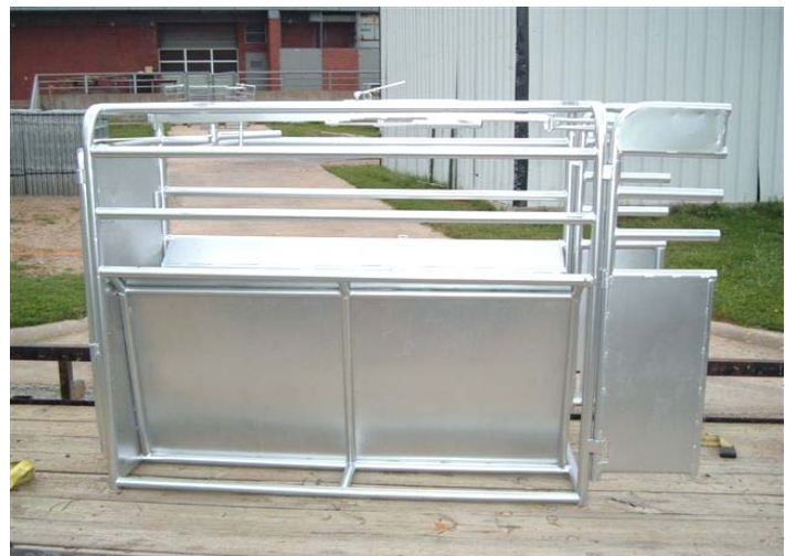
Stripping and Roping Chutes available in electric, remote, and standard options.