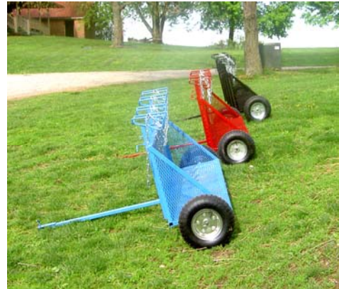
Exercise Chariots come in a variety of colors.