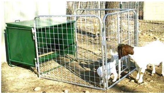
Creep feeder, panels and creep panel.