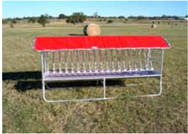
Heavy duty hayrack with trough and rain canopy.