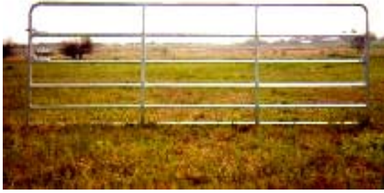
Gates manufactured as heavy as need be or for lighter work. These can be built 4', 6', 8', 10', 12', 14', 16' or custom lengths.