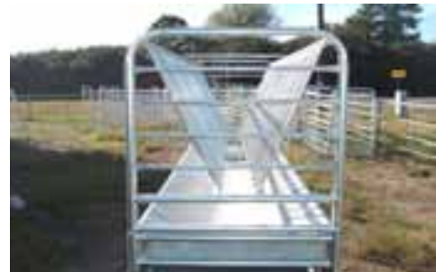
8' Heavy Duty Hay Rack with vertical bars.