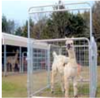
4x4 wire pen can be used for alpacas, llamas or miniature horses even.