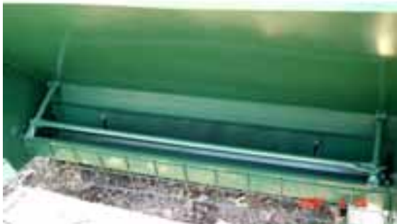
Creep Feeder trough bar.