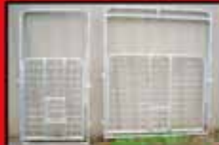
Gates & Kidding Pens