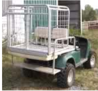
Custom for Golf Cart.