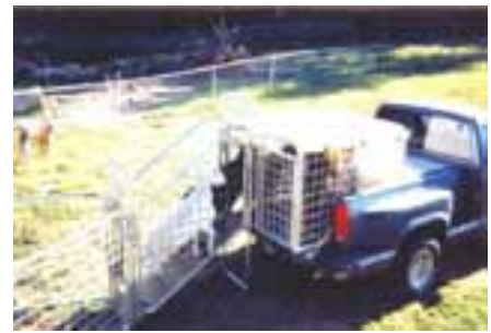
Loading chute in use.