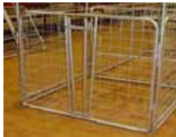
Grafting panel for latching the kids on.