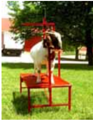
A stanchion for trimming face area or milking out stock.