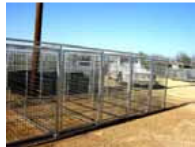
Kennels pin quickly without tools. Kennels can be used for poultry and other livestock as well.