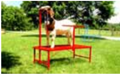
Fitting Stands come with two head pieces.