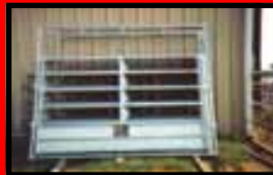
Gates, Round Pens, Arenas, Rough Stock Bucking & Stripping Chutes, various custom options.