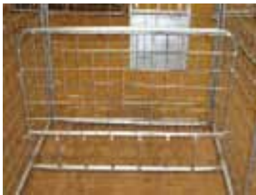
Kid-safe panel allowing that safe space.