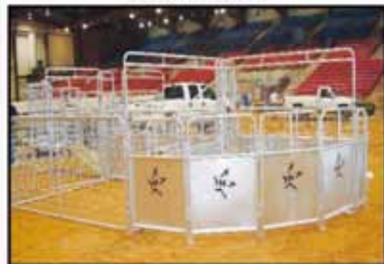
Working Chute Systems