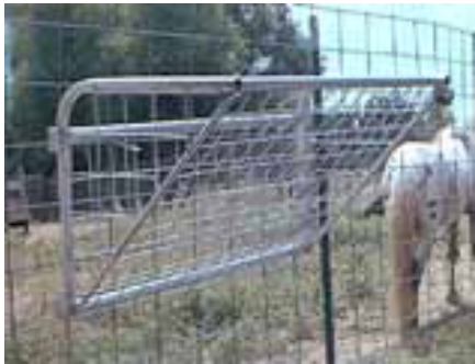
Wall Mount Hay Rack for mounting on walls or hanging over panels or fences.