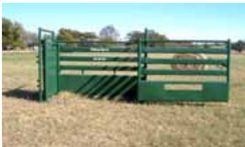
Rough Stock Bucking Chutes