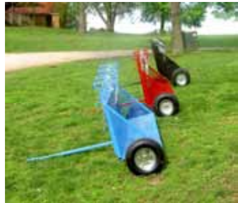
Exercise Chariots come in a variety of colors.