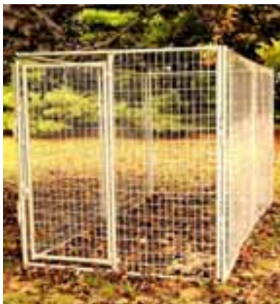
Kennels also come in a variety of sizes. These frames are filled with 2x4" wire panel.