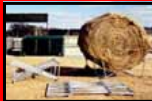
Grain & Hay Feeders