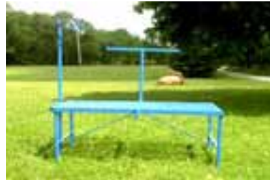
They come in many colors with T sidebar.