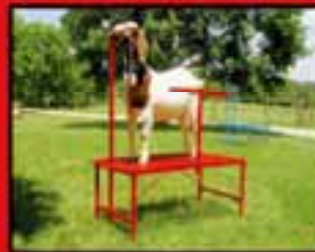
Chariots & Fitting Stands