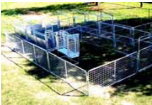
Working Chute set up with panels and sweep tub system.