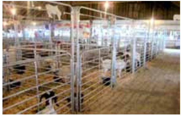
Horizontal nine bar panels and gates come in a variety of sizes.