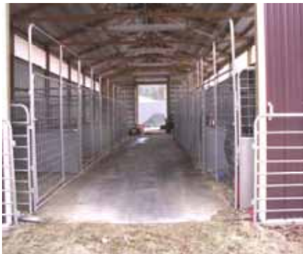
Pictures showing custom options for horse stalls and or livestock pens