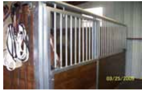
Stalls designed with grills and frames designed for lumber, plywood or sheet metal. Other style options.