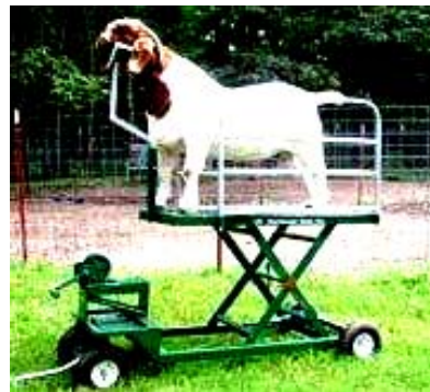
Goat Butler, a unique scissor stand, dollies and raises stock to working levels.