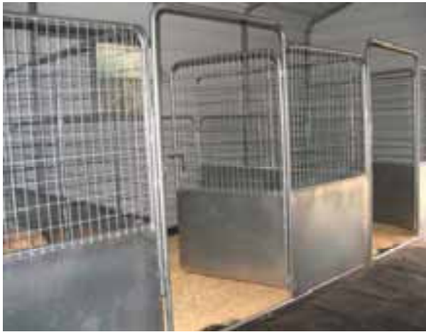
Pictures showing custom options for horse stalls and or livestock pens.