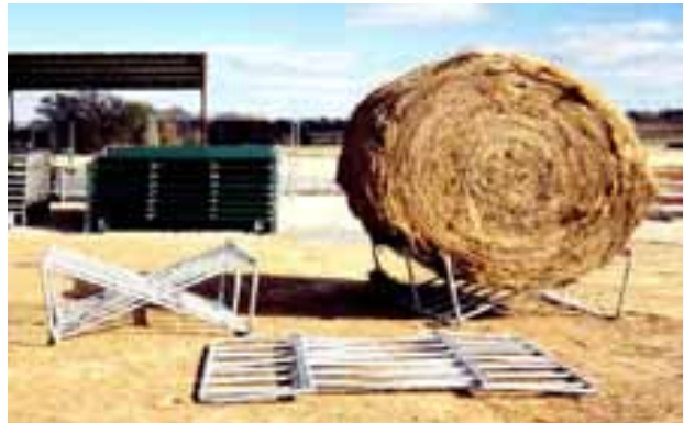
Round bale feeder sets up easy and folds down easily for storage.