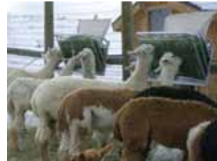
Show pen feeders can be built in larger sizes to accommodate groups of livestock.