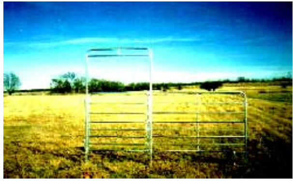
Panel gate shown with skid style feet. Bow-gates come in various widths, heights with 3 different types of latch systems.