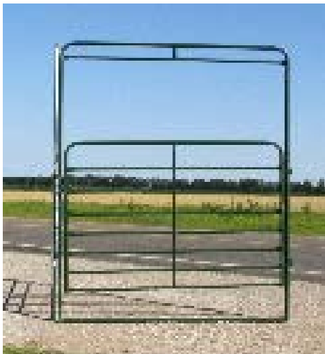
Gate for a corral or round pen, color option green.