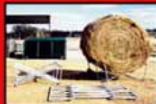
Grain & Hay Feeders