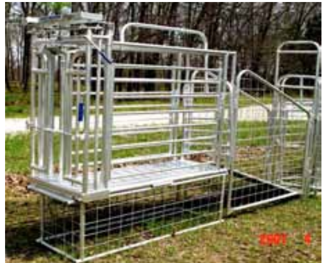
Goat Master Working Chute.