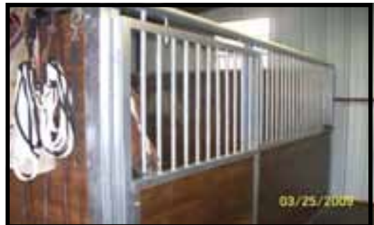
Standard Stall Fronts for Horses: 10' or 12' Front, Swing Gate or 10' or 12' Front, Roller Door Also many other custom options available.