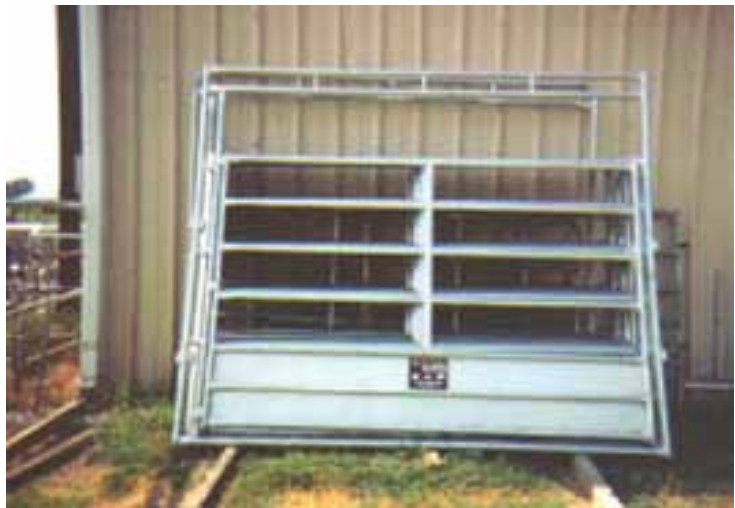
Round Pen gates and panels. Many sizes and options available on all panels.