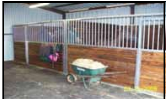
Standard Stall Sides for Horses: 10' or 12' side made for solid wood. 10' or 12' side with grill bars/wood. Stall sides can be made for other materials as well or with 4x4 wire or 2x4 wire for more ventilation and visibility.