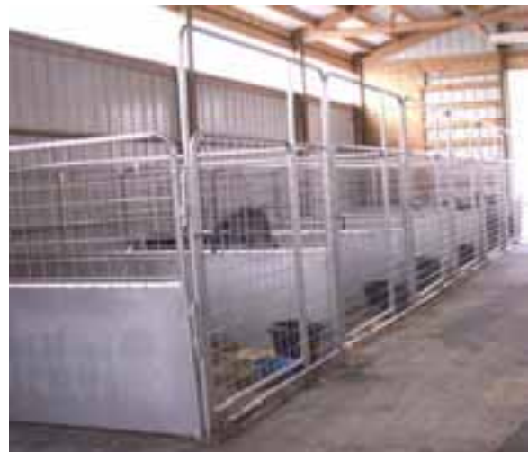
Pictures showing custom options for horse stalls and or livestock pens.