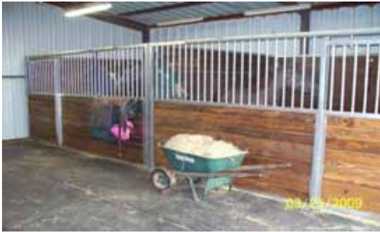
Horse stalls come with swinging doors or sliding roller doors. Add-ons include swing out feed door, bucket door, and feeder.