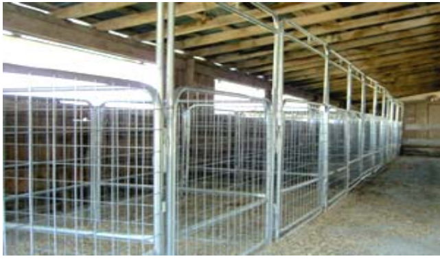
4x4 wire heavy duty panels and gates and a 4x4 wire pen using wallpockets.