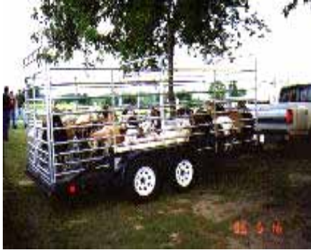
Goat Totes can be built in custom sizes.