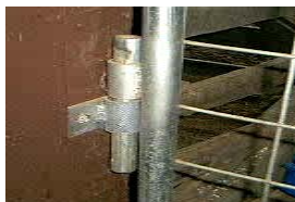
Wallpockets can be utilized to connect to walls.