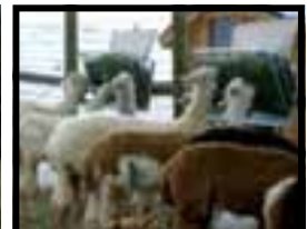
Stalls & Equipment for Mini- Horses, Alpacas, Llamas and more.