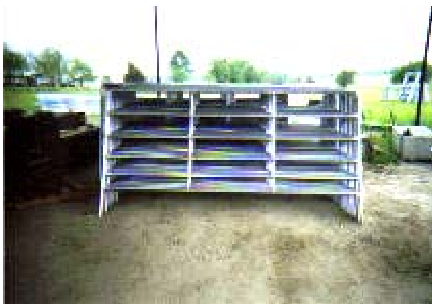
Another panel style with legs versus the skid style feet. Shown are the horizontal bar style panels. Panels available in lighter or heavier gauge.