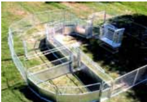
Various Working Chute configurations, sweep tub, drop down panels and alley.