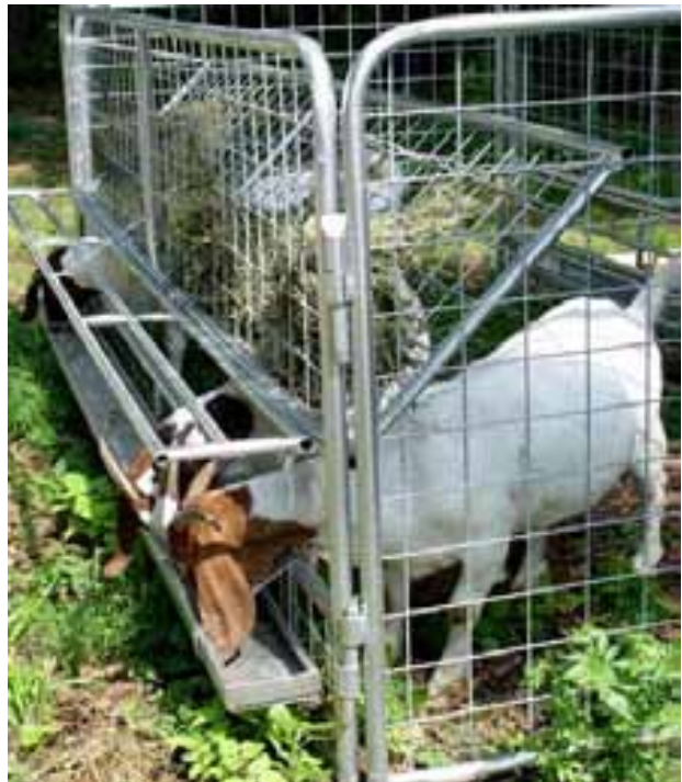
EZ Feeder panel with hayrack.