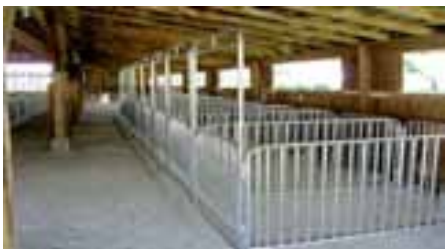
Vertical bar panels and gates prevent climbing on panels, a great option for swine producers or goats and sheep.