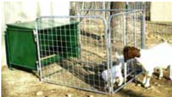
Creep feeder, panels and creep panel.