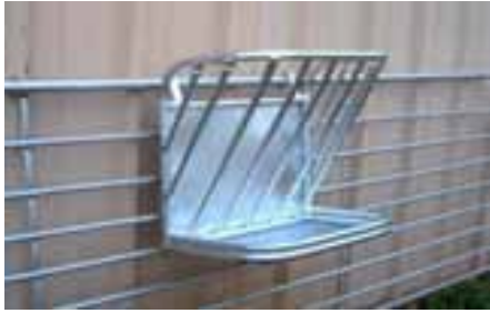
Show pen feeder