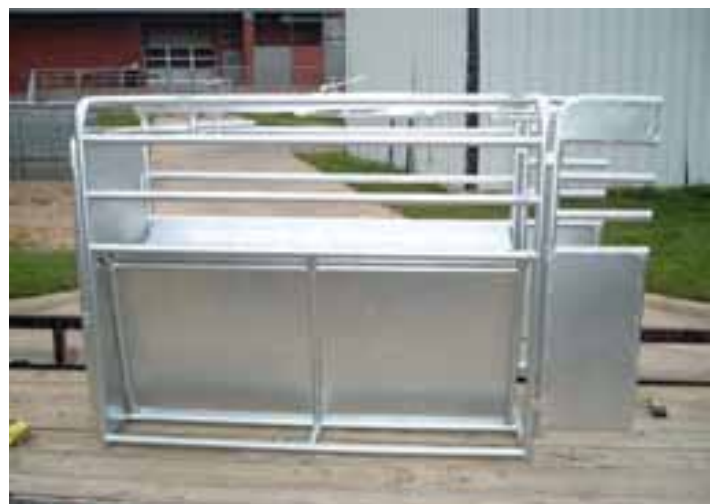
Stripping and Roping Chutes available in electric, remote, and standard options.