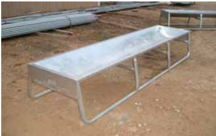
Bunk Feeders are great for horses or cattle.