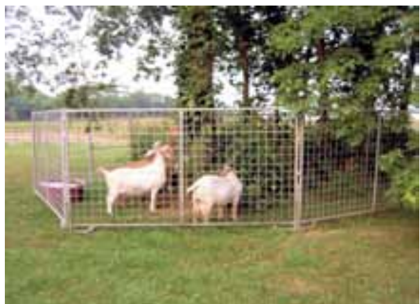
These panels have skid style feet and are filled with 4x4" wire paneling. Pictured at 6' height by 10' length, 7' or 8' at the bowgate.