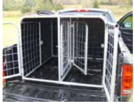
Custom Tote for Pigs with four compartments.