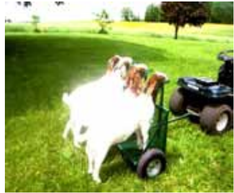
Chariots come with adjustable head pieces and reversible hitch; 2, 3 or 4 head piece systems sold.