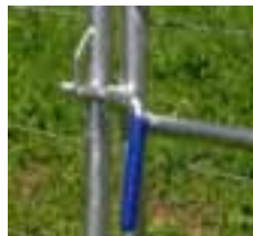
Latch options for gates: vertical, chain and horizontal latches.