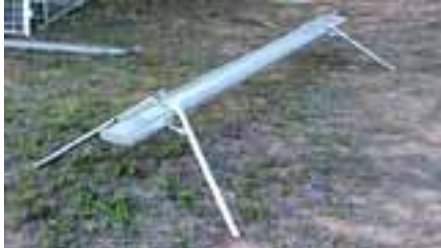
Econo-trough with bar