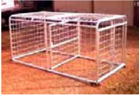
8' Goat Tote with divider panel.