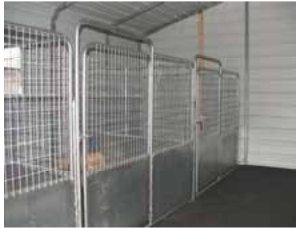
Pictures showing custom options for horse stalls and or livestock pens.