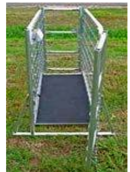
Scale and Scale Cage.