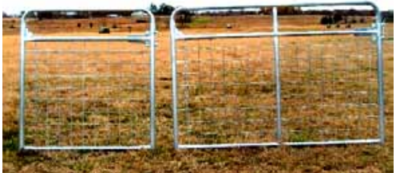
4x4" wire filled Sheep and Goat pasture gates come in a variety of lengths as well as custom.